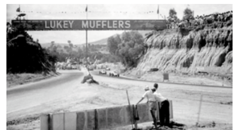
The Narrows - circa 1961