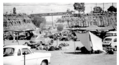
The pits - circa 1961