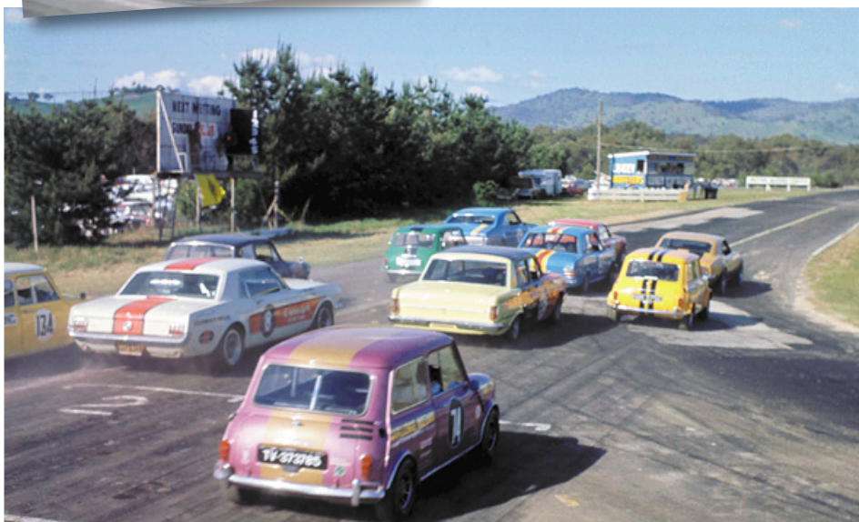
Start of a race in 1969. Inset: The pit area in the same year.